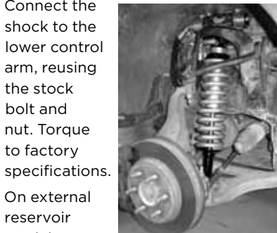
Fig. 2: Passenger side