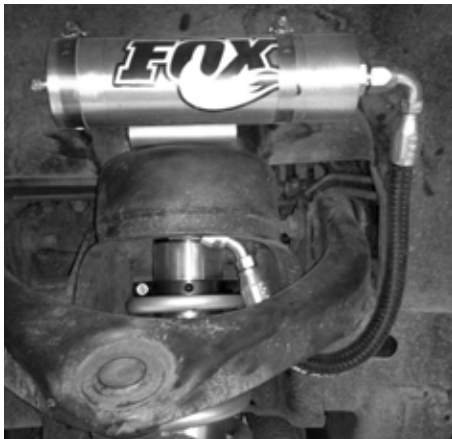
Fig. 2: Passenger side

stock shock. Be careful not to damage any brake lines or electrical wires.