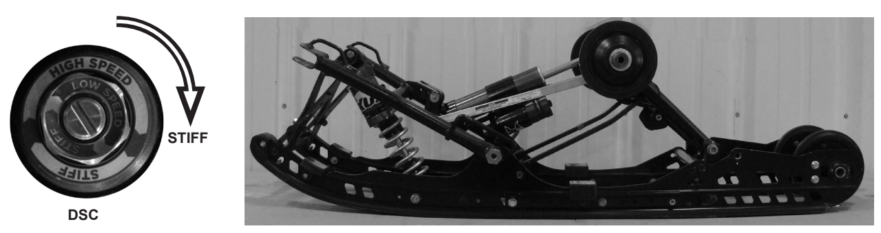
Reset limiter strap and rear spring preload to noted settings. Install the rear suspension. Torque all bolts and mounting hardware to manufacturer's specifications. Adjust the track tension to the manufacturer's specifications.

FOX 2.0 ZERO RC2 Rear arm shock is positioned above with the reservoir mounted below the shock body, with the rebound adjuster facing up when connected to the rear arm. Low and High Speed Adjuster (DSC) and Rebound are set at 12 clicks out from bottom. Each adjustment has a total of 24 clicks, start counting clicks from the adjusters most clockwise limit. Use a flat blade screwdriver for the Low Speed adjustment, 17mm wrench for the High Speed adjustment and a 8mm wrench for the Rebound adjuster, start counting clicks from the adjusters most clockwise limit.