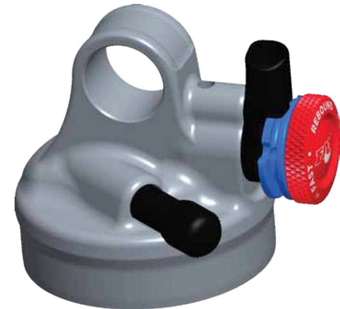
EYELET ASSEMBLY, FLOAT DPS REMOTE UP, SV

PROPRIETARY - THIS DOCUMENT CONTAINS CONFIDENTIAL, PROPRIETARY INFORMATION THAT IS FOX PROPERTY. DO NOT DISCLOSE TO OR DUPLICATE FOR OTHERS EXCEPT AS AUTHORIZED BY FOX.