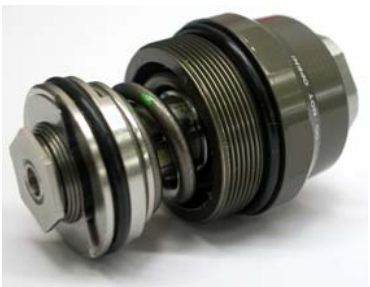
(Figure 1) High-speed piston and preload spring

The DSC valve has two parallel paths through which oil flows. The low-speed circuit is an adjustable needle and jet seat. The high-speed circuit is a valve stack backed by a compression spring. The preload in this spring controls the point at which the valve stack opens (figure 1). These two independent adjusters are shown in the diagram below (figure 2).